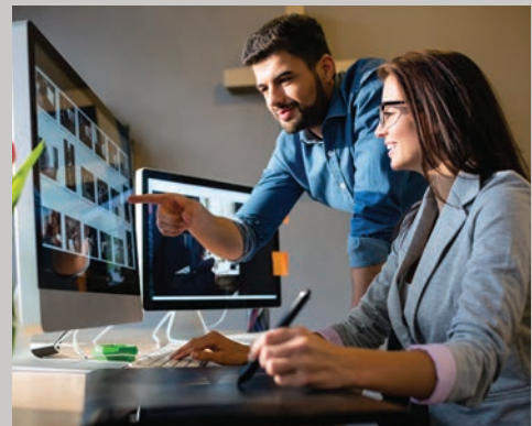
CONTENT DEVELOPMENT Our specialists know how to take your visual elements and create content that connects with customers.