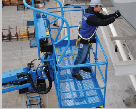
INSTALLATION Rely on our experienced installers and state-of-the-art equipment to get your visual graphics safely and professionally installed.