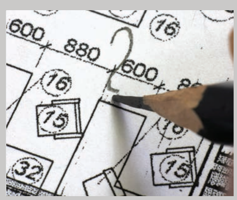
SURVEYING & PERMITTING We understand the importance of getting the details right, so we measure and ensure that we have the proper permits before moving forward on your projects.