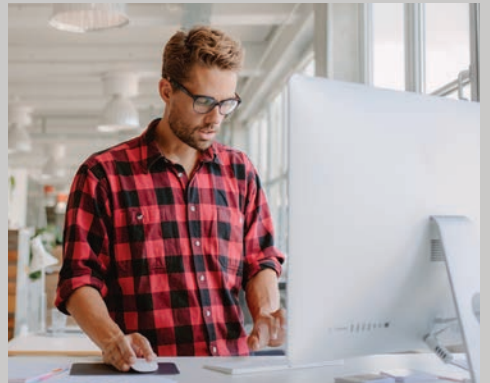
GRAPHIC DESIGN Our graphic designers are experts at getting your message noticed.

We're a company of collaborators, strategists, graphic experts and problem solvers all focused on one thing: helping you visually communicate your message.