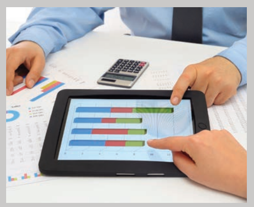
PROJECT MANAGEMENT We take your project from concept to completion®, meeting timelines and budgets.