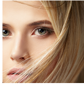
150 dpi (Okay)

Please send all photos in a high resolution file. Providing us with a low resolution file will result in a poor product.