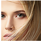
72 dpi to 300 dpi (Not a good idea)