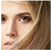
72 dpi (Worst)

If you are concerned about how to send large files, you can go to our website www.fastsigns.com/2108 . See buttons on right side, click on "Upload Files" and follow directions. We can also use WeTransfer, Google Drive and Dropbox. Ask your Sales Representative if you have further questions on sending any files to us.