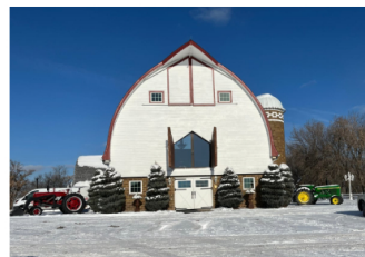
Green Acres Event Center, a converted barn along Pioneer Trail, was the venue for the Eden Prairie Chamber of Commerce's 2025 "Of the Year" Awards.