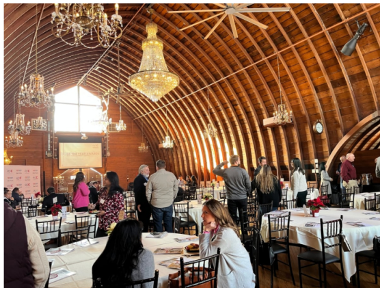
Eden Prairie Chamber of Commerce members and guests mingled at Green Acres Event Center prior to the luncheon and ceremony.