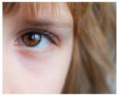
300 dpi (Best)