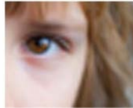
72 dpi to 300 dpi (Not a good idea)

Please send all photos in a high resolution file. Providing us with a low resolution file will result in a poor product.